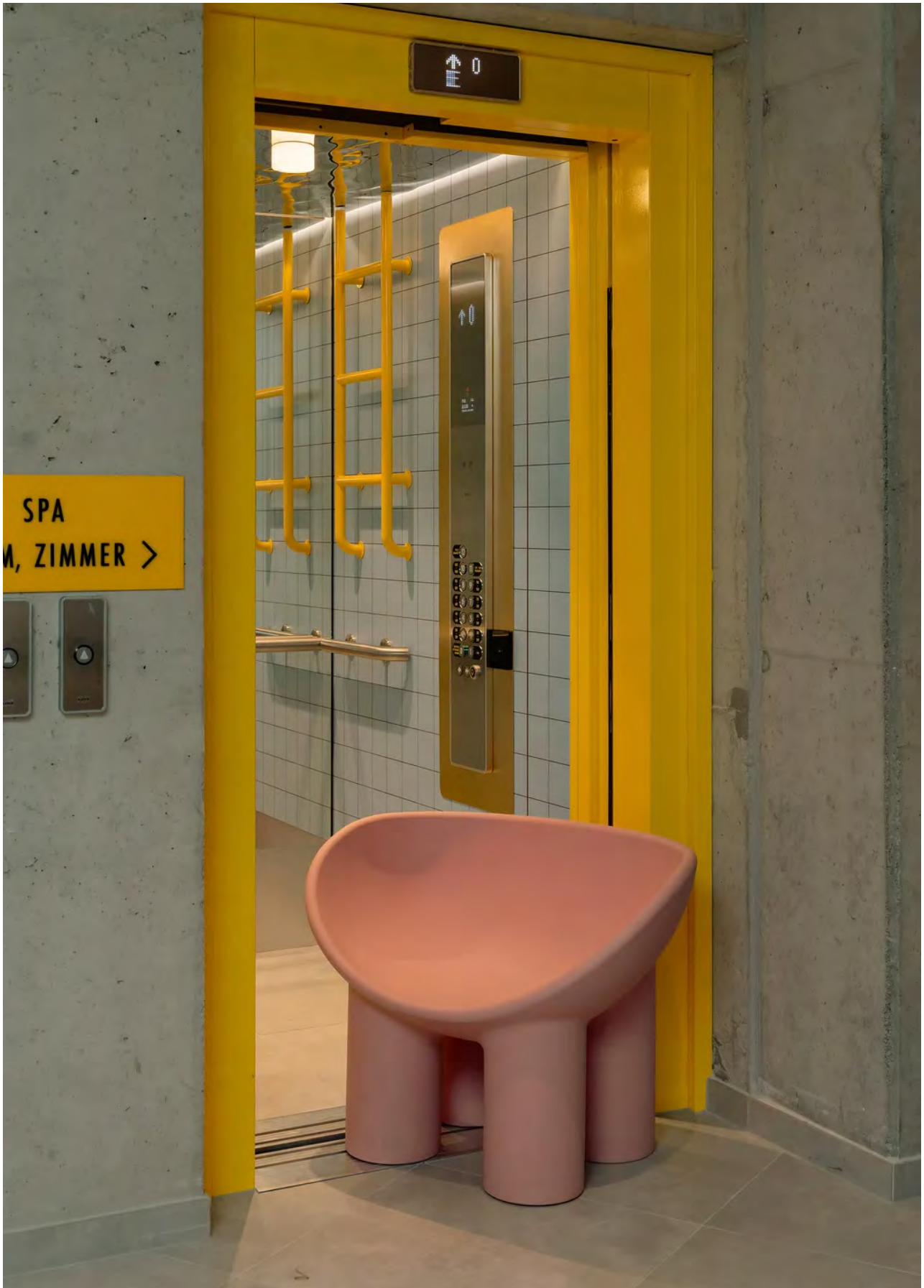
Hotel Badeschloss detail