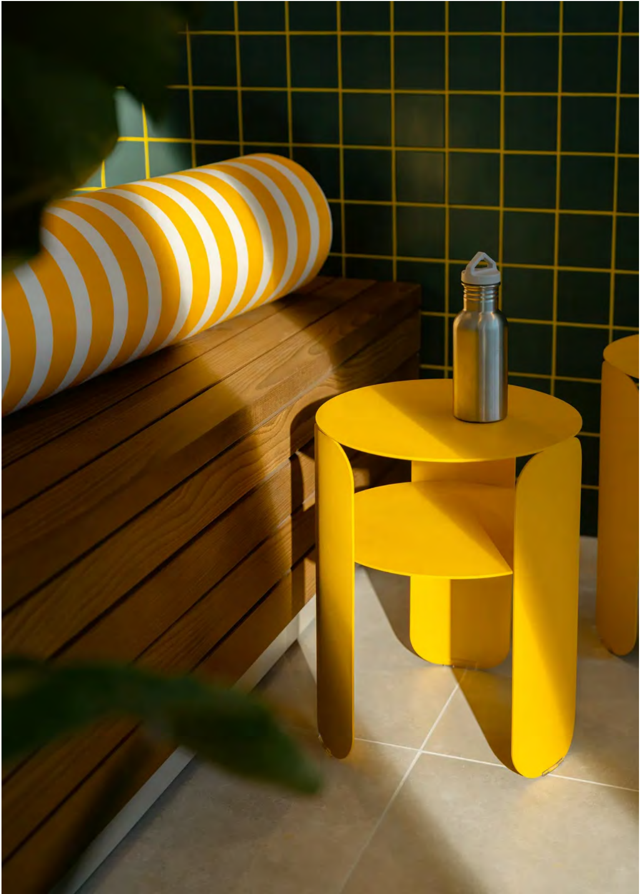
Hotel Badeschloss Spa