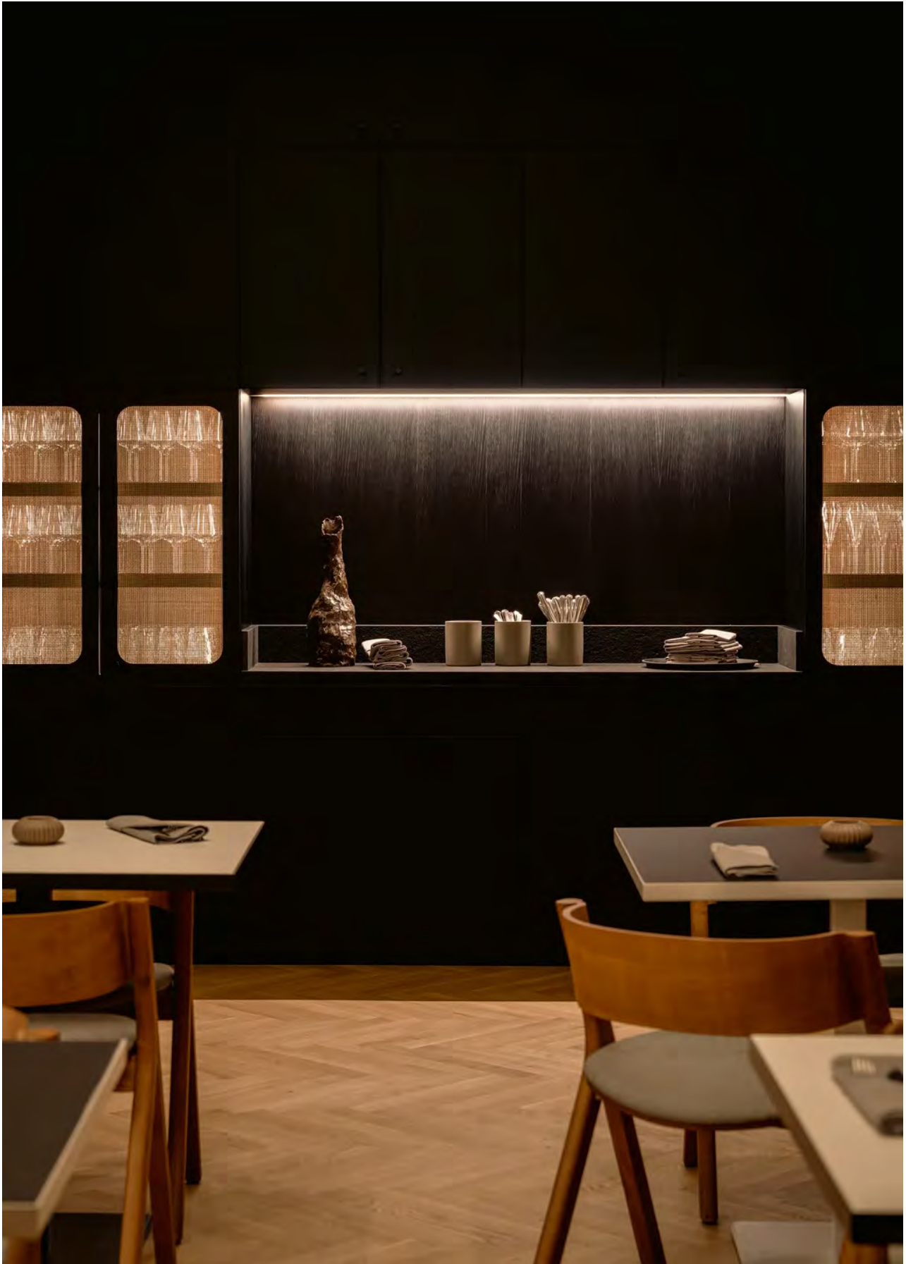
Hotel Badeschloss' Dining Room