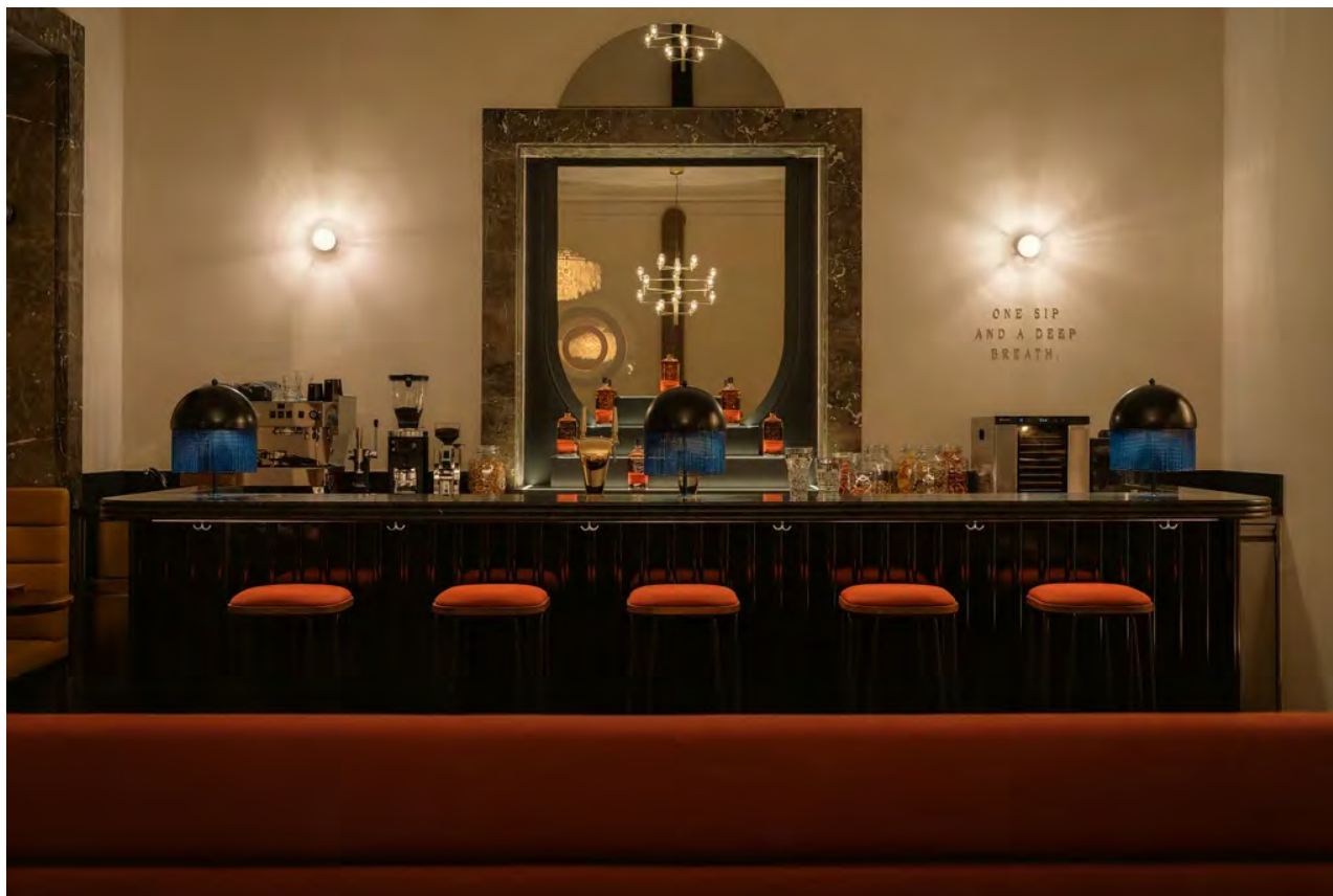
Hotel Badeschloss' Fireplace Lounge

[always] important to us to work with — and not against — the remnants and layers of the past. It's precisely those layers that give old buildings their charm and special appeal and make them unique.'