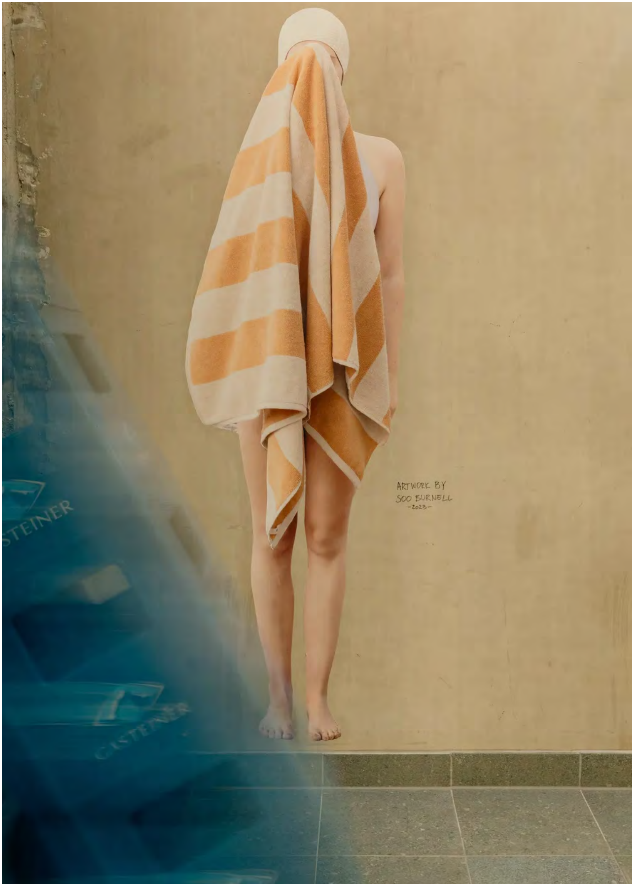
Hotel Badeschloss' curated art concept