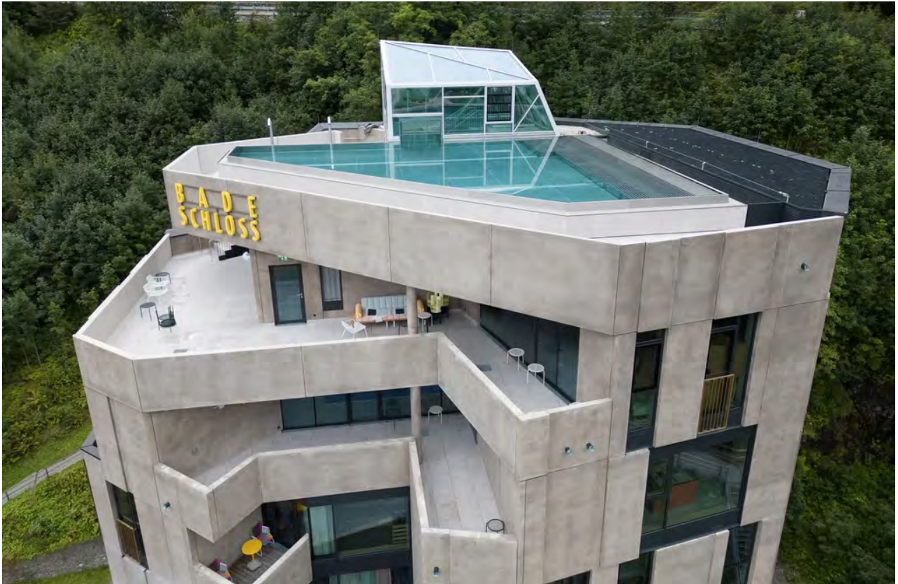
BWM Designers & Architects' 13-storey new addition to the hotel's historic building

The Badeschloss, which translates as 'bathing castle', was originally built in the late 18th century as a public spa, and it has a rich history, having hosted German Emperor Wilhelm I and later served as a military spa. After a period as a hotel from the 1920s, the building had more recently fallen into disrepair.