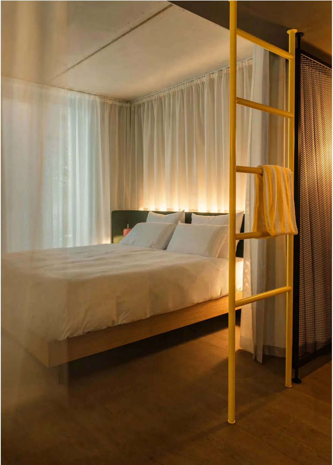
Hotel Badeschloss' room