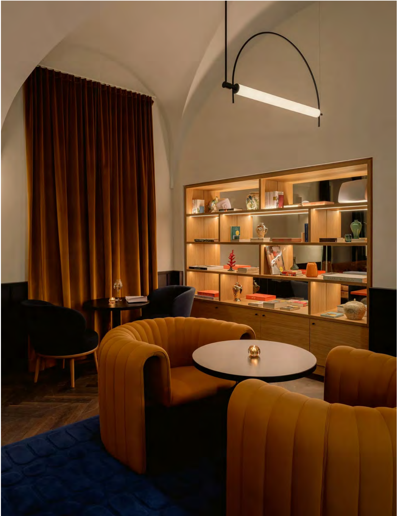
Hotel Badeschloss' Salon