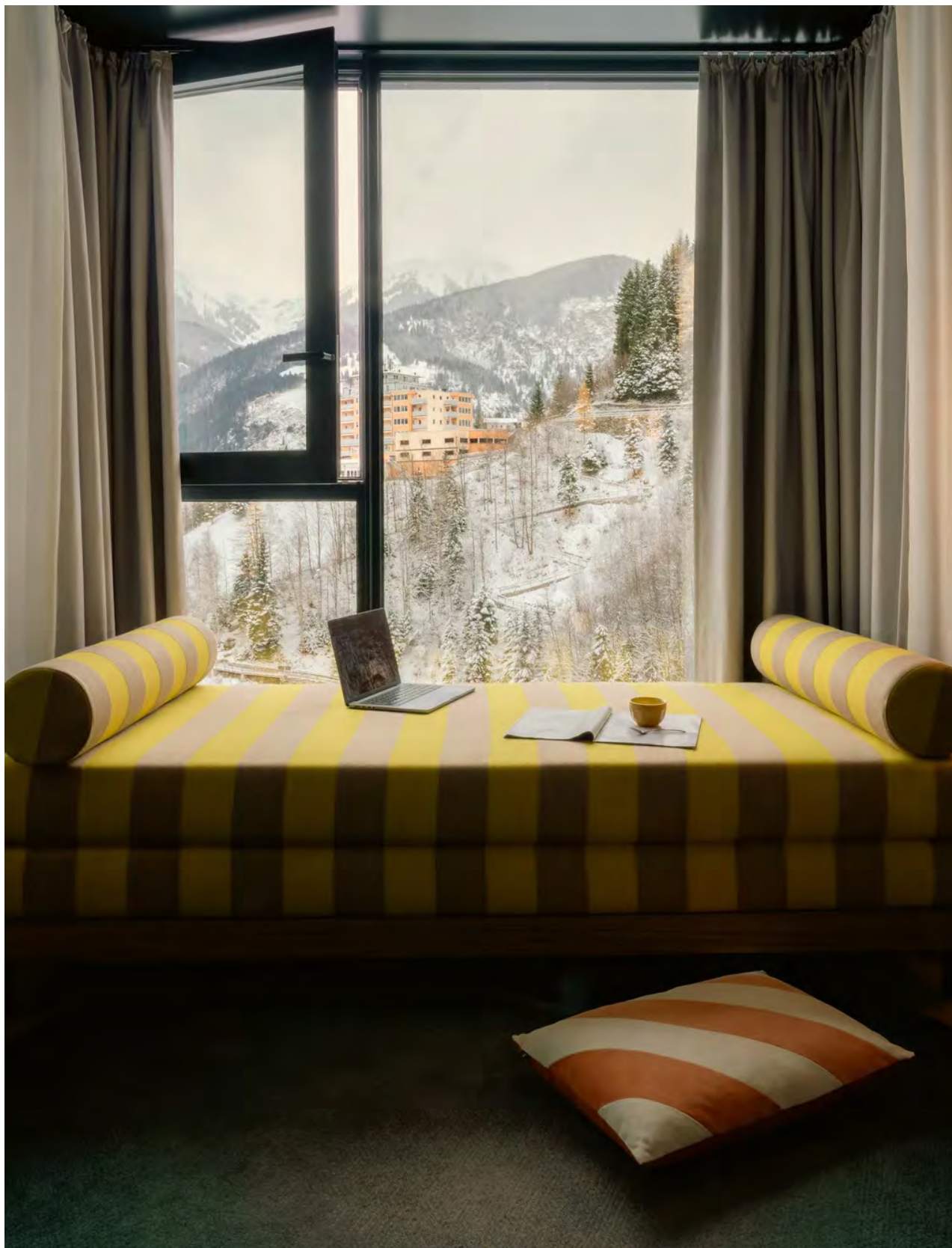
Hotel Badeschloss' suite views