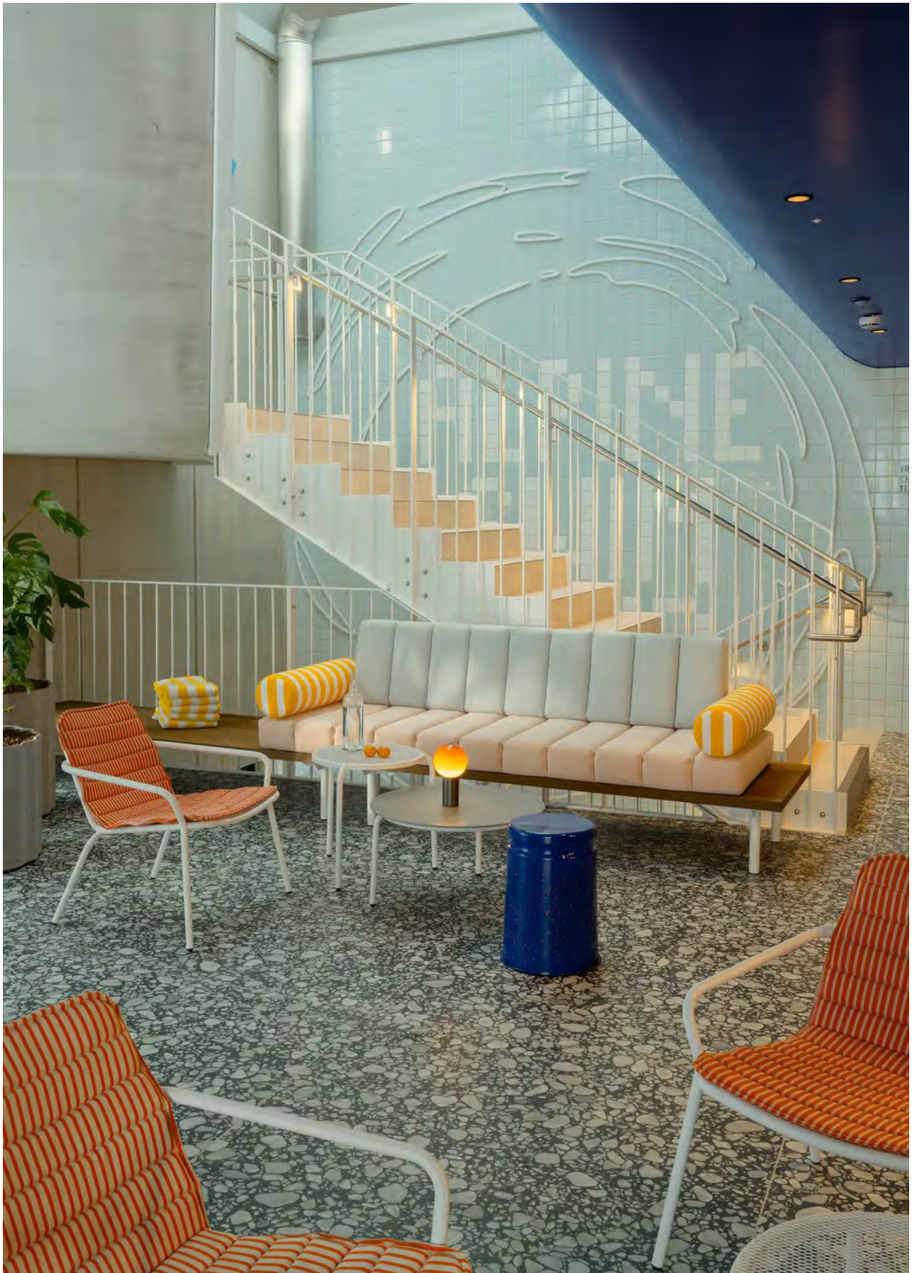
Hotel Badeschloss Spa