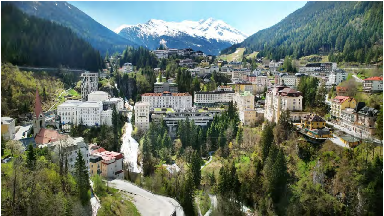
Hotel Badeschloss' views

group of contemporary artists from Bad Gastein and beyond contributed their creative works to create a unique offering within the space.