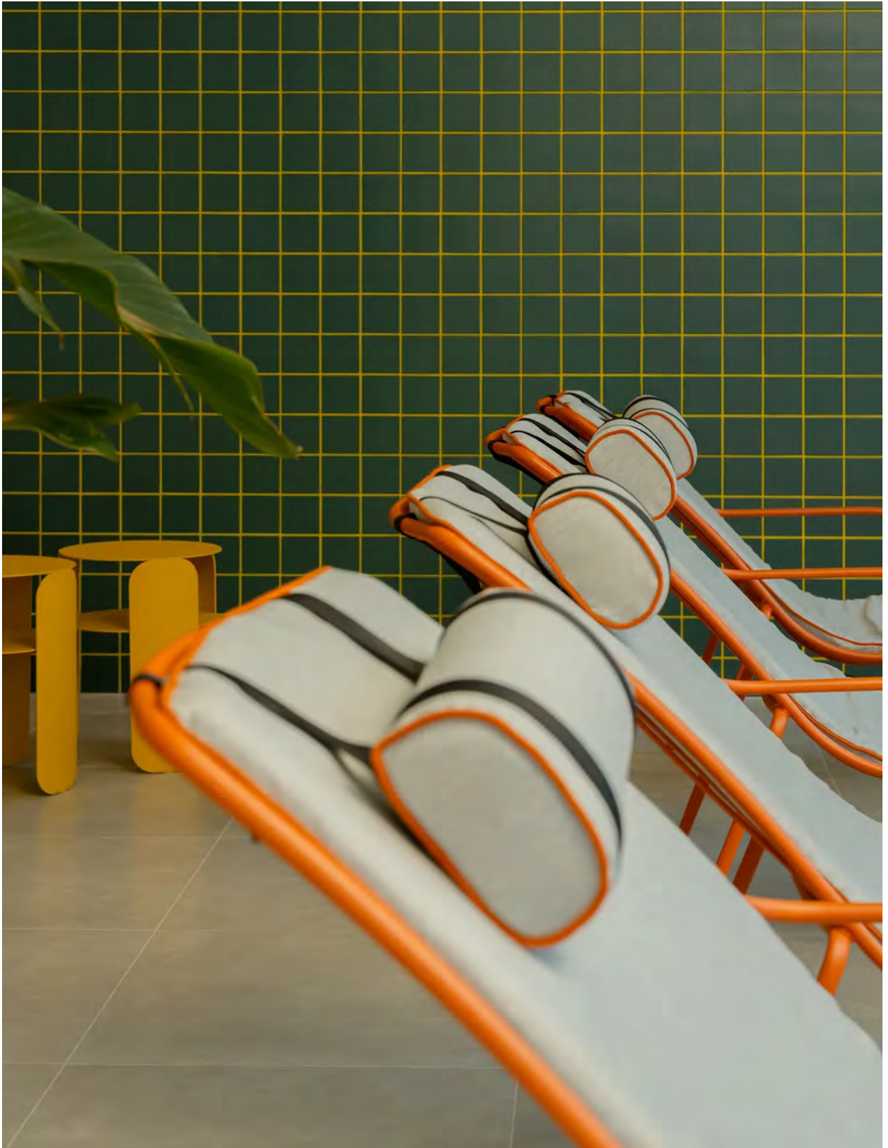
Hotel Badeschloss Spa