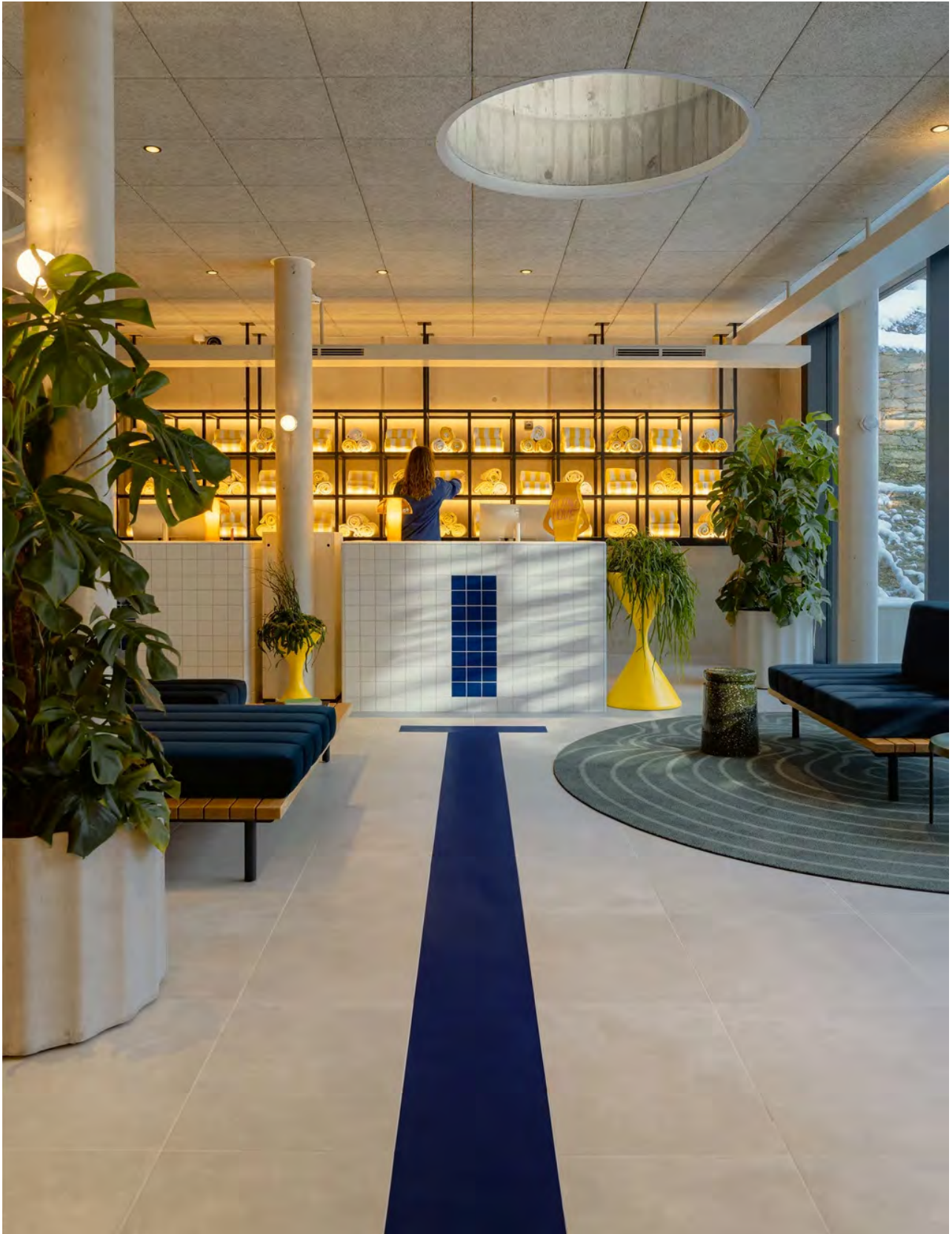
Hotel Badeschloss reception area