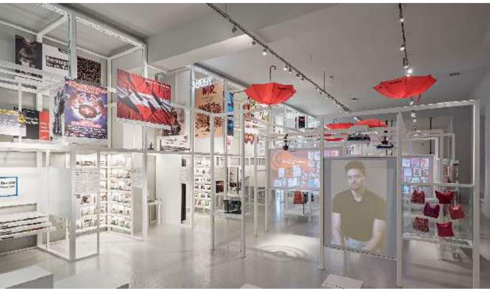
Museum for Austrian Literature ▾