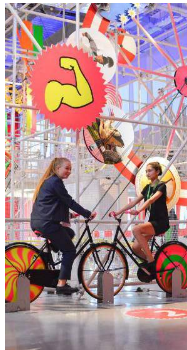
Exhibition "Higher Powers", Kunsthistorisches Museum ▾