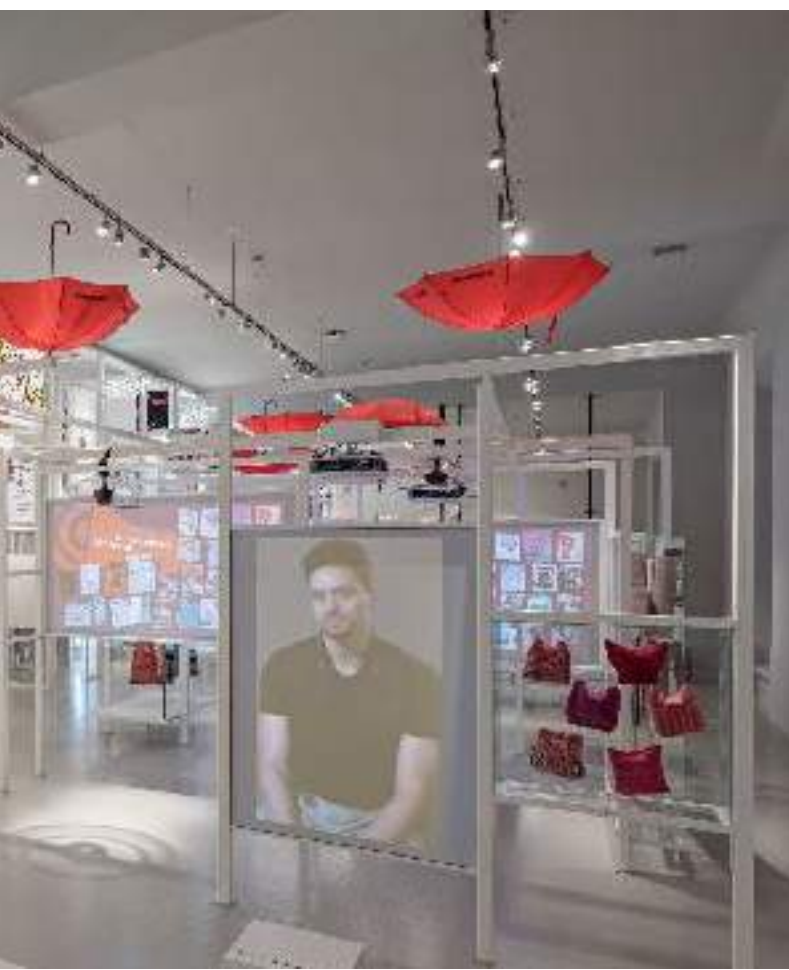
△ House of Austrian History (hdgö)