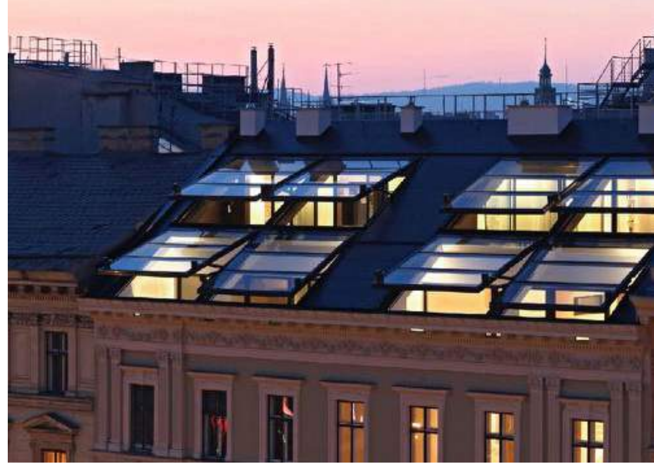
Roof construction Bellariastrasse \triangle