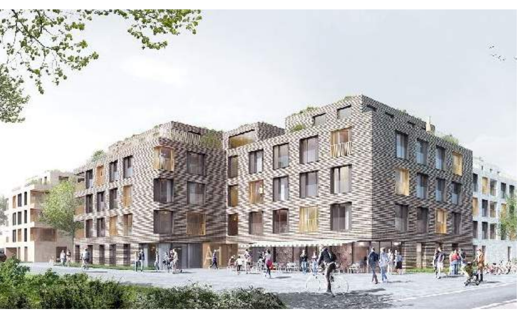
Werkstattverfahren Hagedornplatz / Reicker Strasse 51 \triangle