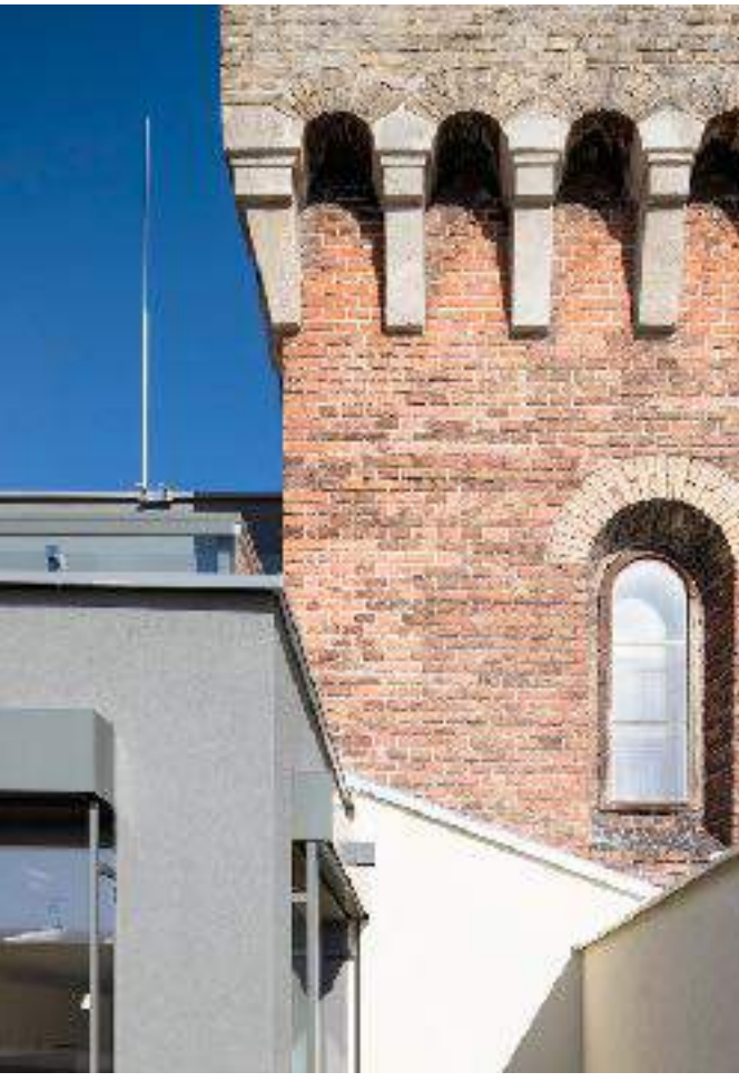
Arsenal, Object 16 🛆

Residential architecture Selected references 2021