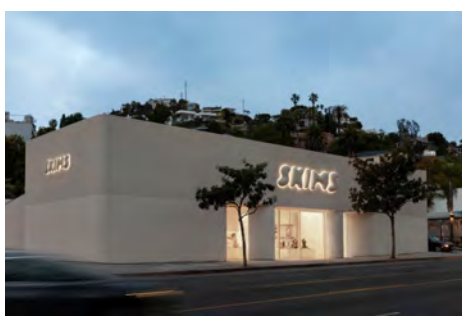
Openings: Immersive exhibitions and flagships galore