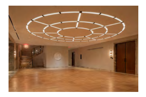
Openings: From New York to Osaka and Milan, it's all monumental